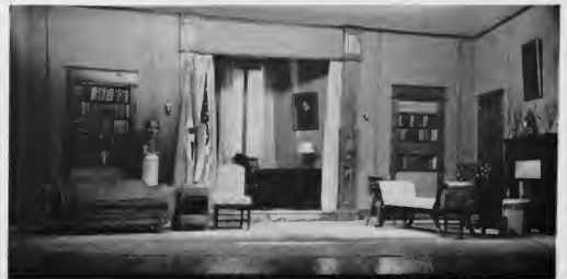
1939— Margin for Error —March, 1941